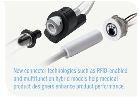
New connector technologies such as RFID-enabled and multifunction hybrid models help medical product designers enhance product performance.

In addition to connecting tubing to facilitate and control the flow of fluid, new connector technologies can bring other functionality and performance attributes to medical devices and equipment. Intelligent connectors equipped with radio frequency identification (RFID) technology allow data exchange at the point of connection. Intelligent couplings communicate by sending RFID signals between the two separated coupling halves. Data is stored on an RFID tag embedded in the passive half of the coupling, known as the insert. Looking for the tag is an RFID reader housed in the active half of the coupling, called the body. When the two coupling halves are brought within a few centimeters of each other, the reader detects the tag, reads it, and sends the tag data to the control unit running the system. The control unit can also tell the reader to write new information to the tag. Communicating couplers can transmit information that helps protect equipment, improves processes and even saves lives in medical applications.